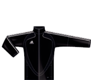
Men's Trofeo Training Jacket 609150 Black/White $65.00