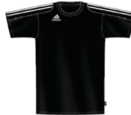
Men's Squadra II Jersey 742180 Black/White/White $23.00