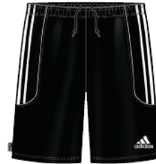
Men's Squadra II Short 745567 Black/White $20.00