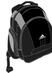
Velocity II Field Backpack 321696 Black $55.00