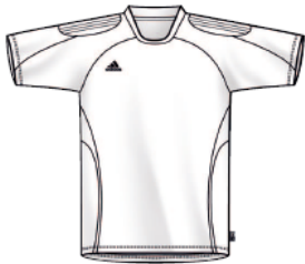
Men's Toque Jersey 623087 White/White $35.00