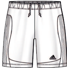
Men's Toque Short 623339 White/White/White $20.00